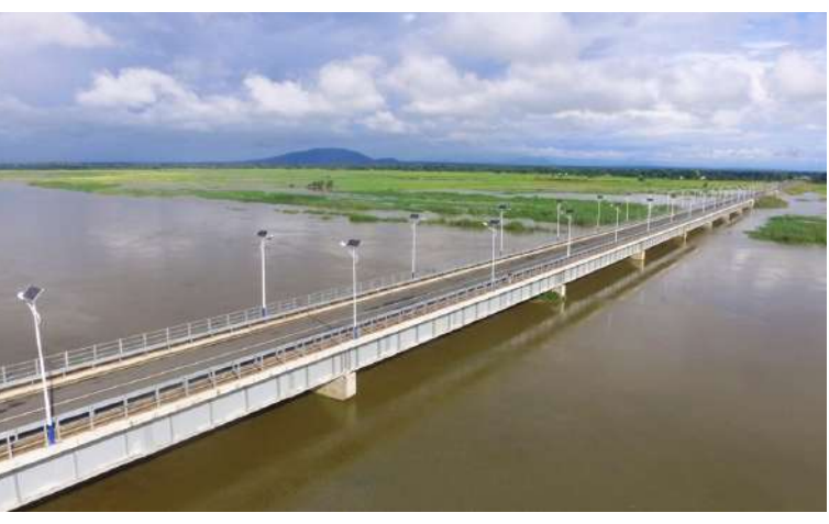
Magufuli Bridge at the Kilombero River in Morogoro Region. The bridge is 384 metres long