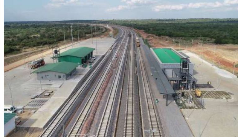
One of the modern railway station, part of the (300km) Dar es Salaam - Morogoro route at Soga area in the Coast Region.