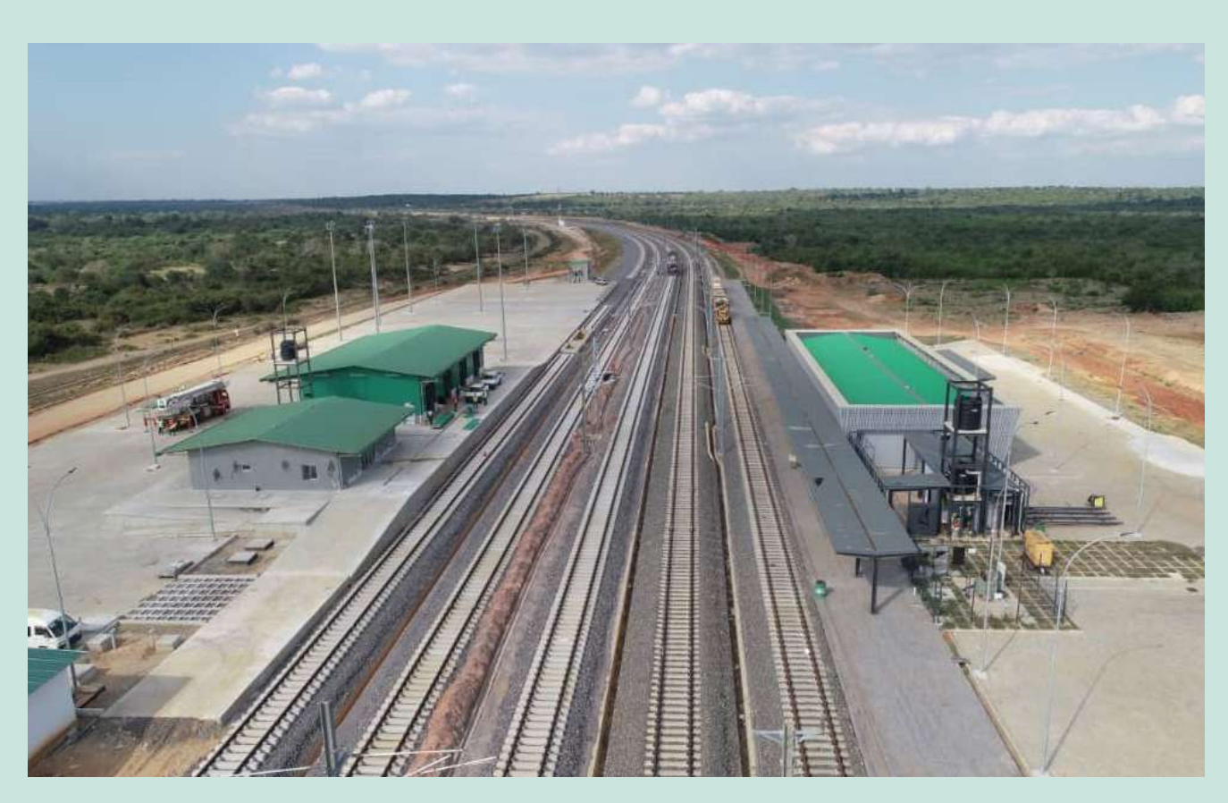
One of the modern railway station, part of the (300km) Dar es Salaam - Morogoro route at Soga area in the Coast Region.

Tel: +255 26 2324455, Fax +255 26 2323233 E-mail: ps@mow.go.tz