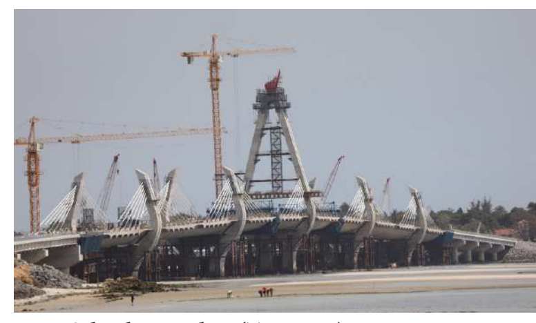
New Selander Bridge (Tanzanite) in Dar es Salaam. The bridge whose construction has been completed is 1.03km in length and 20.5metres wide.