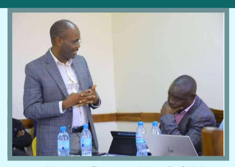
Works and Transport minister Prof. Makame Mbarawa, clarifies a point before the Parliamentary Infrastructure Committee (PAC) on infrastructure immediately after the committee received a report on the performance of TBA and TEMESA in Dodoma.