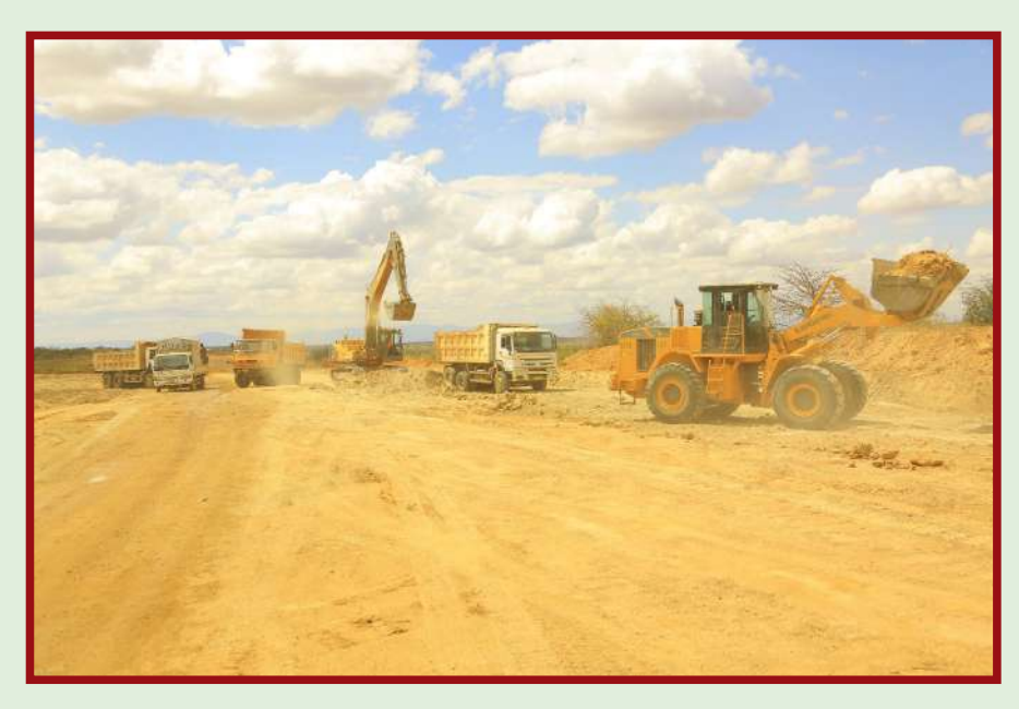
The ongoing construction work of the Dodoma City Dual CarriageWay Ring Road which is expected to be completed in March 2025.

Dodoma City Outer Ring Road, is expected to be completed in March 2025, where among other things it will reduce congestion in Dodoma city and stimulate economic growth of the region.