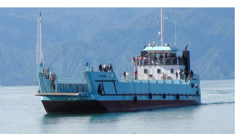
The new cargo ship, MV. Njombe which provides services between the port of Itungi-Mbamba-Bay and the neighboring country of Malawi in Lake Nyasa.