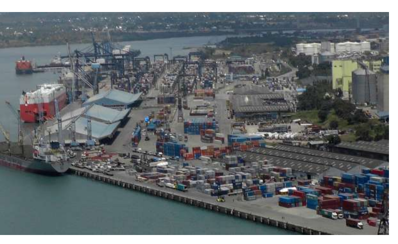
A birds eye view of the Port of Dar es Salaam whose expansion has already been completed, enabling large ships to dock at the port.