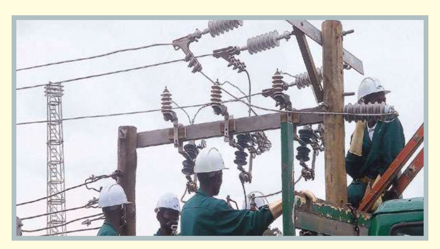
An Electric Task Force in Dodoma City, has embarked on a project to light up Dodoma city in a TSh 12 billion worth project

The task force will also see the implementation of security cameras at all road junctions of Mtumba government city at the cost of TSh 2.5 billion.