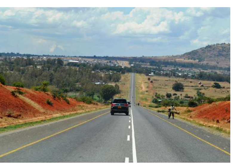
Vehicles seen cruising the 112 km Sumbawanga-Matai-Kasanga Port road in Rukwa Region whose construction to tarmac level has been completed.